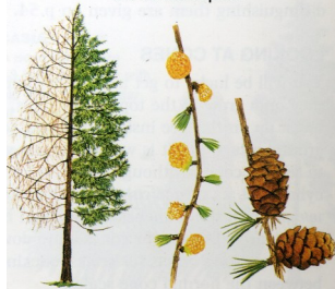
Most of our larches are Japanese larch

Larix kaempferi L1 1.5-3cm. Difficult to tell apart from common larch, but the twigs are darker, purplish, orange, or reddish, and the leaves paler.