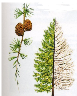
COMMON LARCH ▲ Larix decidua

L1 1-3cm. A tree from the high mountains of Europe, grown here for ornament, timber and sometimes for shelter. Needles turn golden brown before they fall.