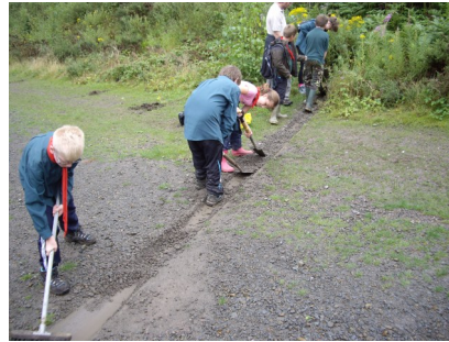
Cubs and scouts keeping the drainage channels clean

August saw a party of cubs and scouts doing maintenance work in the woodland as part of their work towards a community badge. They cleared all the litter from the car park - and, as you are probably aware, there is an awful lot of it - as well as clearing all the debris from the drainage channels, which have filled due to the appalling weather this summer.