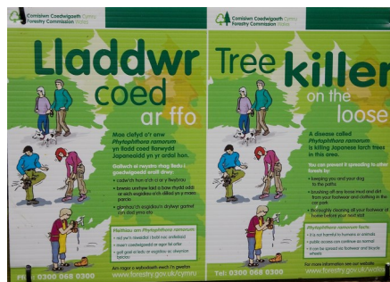
Advice from the Forestry Commission regarding phytophthora

There are some precautions we can all take. We make sure any vehicles using the woodland have clean wheels before they come in. If you have been walking elsewhere, clean your boots before coming to Blaen Brân. The same applies to bike wheels. Please keep to the tracks and clean dogs' paws after visiting woodland. It's not harmful to humans or animals.