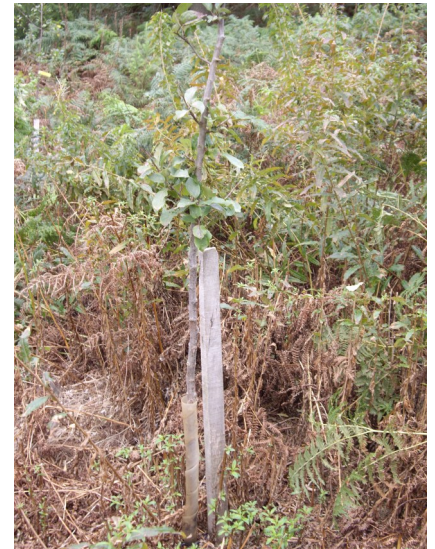
One of the apple trees planted this year.

Thanks to Stuart Ashley of Cwmbran Community Council, we have now planted a number of fruit trees in the woodland. There are 26 trees, a mixture of apple, damson and pear. The chances of actually picking fruit are extremely low but these trees will attract wildlife.