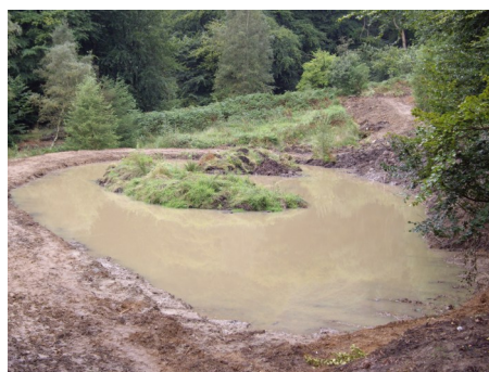
The new pond - thanks to this awful summer, we didn't have to fill it.

The only pond which was any good was the one near the stream, just off the top track by the gate by the spring. So we decided that was probably the best place to site one that could be a decent size and might actually last.