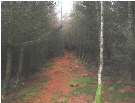
In amongst the larches - how soon before this is a thing of the past?

The Forestry Commission view is that it is a matter of when rather than if. So, at present, we are on high alert for any signs of the disease in the woodland.